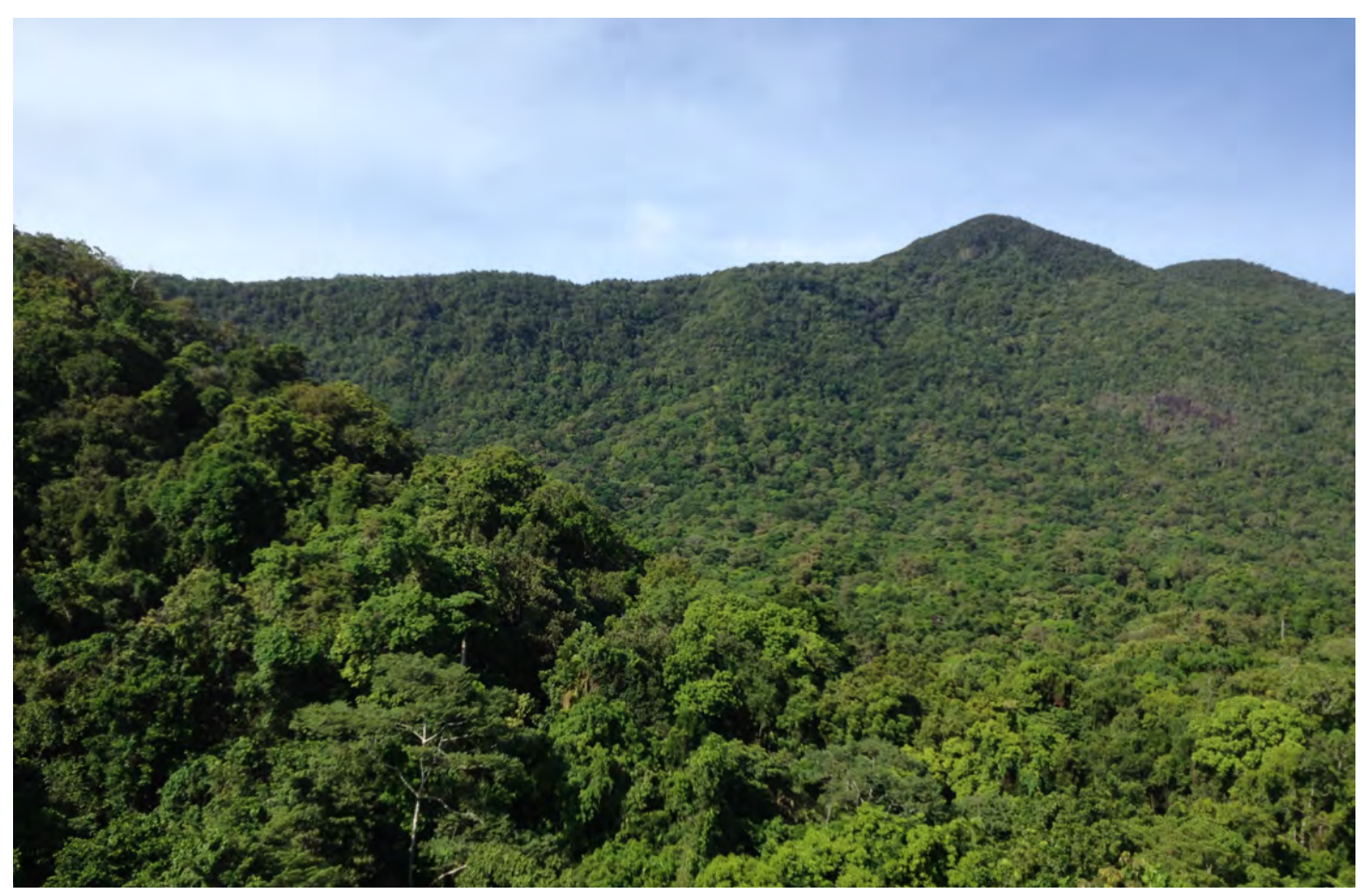
The rainforests of the Daintree are some of the last tropical lowland forests in Australia that have avoided the impacts of an extensive road network.

That's where we come in... Bill's team is leading a major international research effort to devise a strategic and proactive scheme for identifying