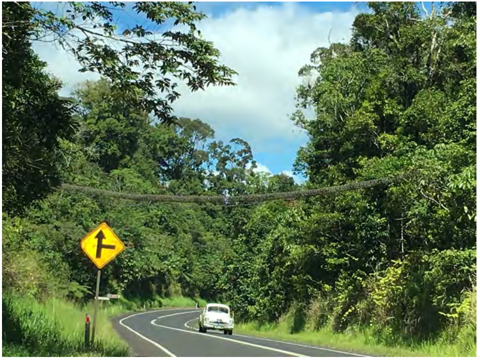
Mitigation measures such as these rope bridges across the Palmerston Highway in tropical far north Queensland, can assist in ameliorating the impacts of tropical roads on arboreal fauna species.