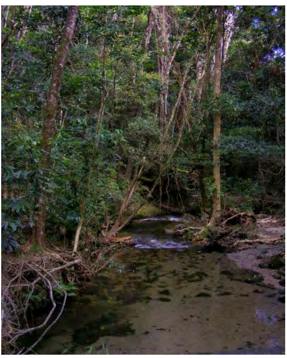
The clear mountain streams of upland catchments are often threatened by the impacts of road construction, facing sedimentation and altered drainage patterns.